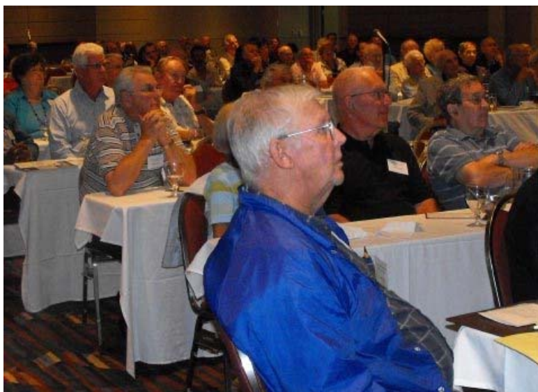
Over 200 men and their partners attended the Seminar!

The "2nd Annual W.B. Ingalls Memorial Prostate Health and Cancer Seminar was held Saturday, March 7, at the Palm Beach Convention Center.